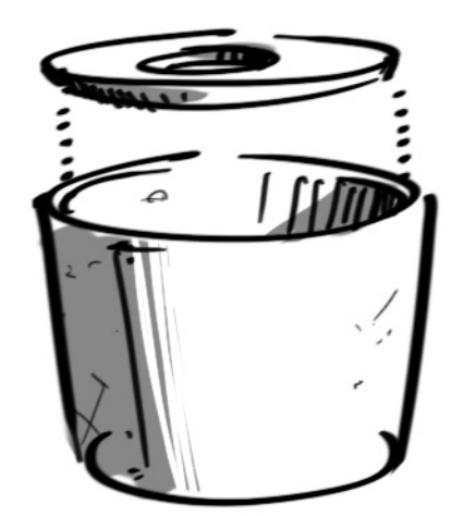
Fig 2a Press fit an endplate configuration

The end plate of the cup will have a 0.8" hole in the center so that the ejector can fit through it. We will use the water jet cutter to make these parts. If you are unfamiliar with the OMAX software and other CAD programs, you may want to run through the tutorial before starting. Use the OMAX Layout program to generate the tool path for the three end plates. You will be shown how to use the water jet cutter in class.