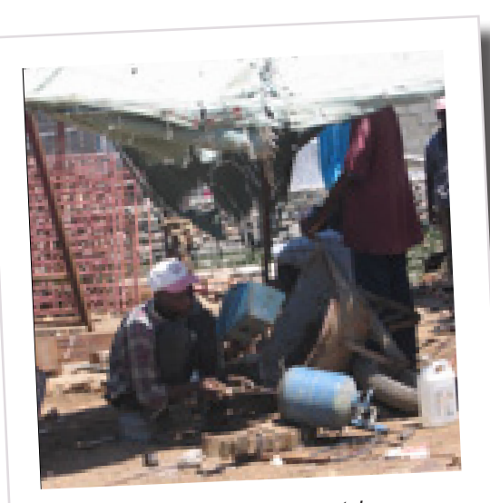
Fig 3a Welding in Haiti: Oxyacetylene welding in a village without electricity

Be sure to use protective clothing and goggles, as the radiation and extreme light can be dangerous to your skin and eyes