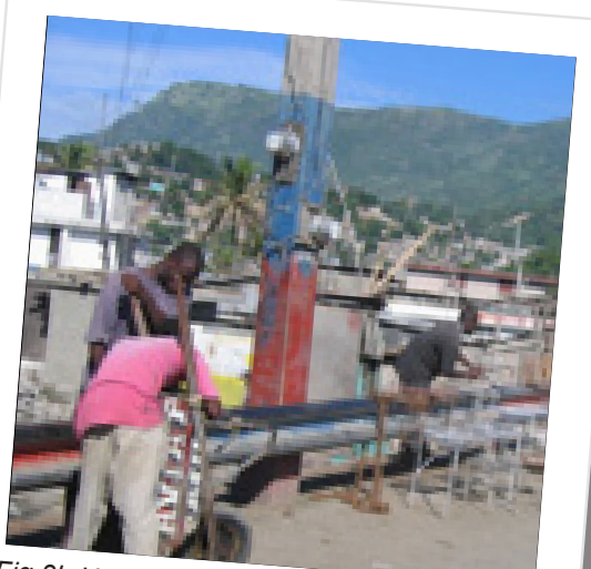
Fig 3b Using electricity from utility pole to arc weld on the side of the street

These materials are provided under the Attribution-Non-Commercial 3.0Creative Commons License, http://creativecommons.org/licenses/by-nc/3.0/. If you choose to reuse or repost the materials, you must give proper attribution to MIT, and you must include a copy of the non-commercial Creative Commons license, or a reasonable link to its url with every copy of the MIT materials or the derivative work you create from it.