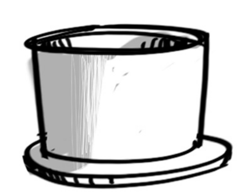
Fig 2b Overhang endplate configuration