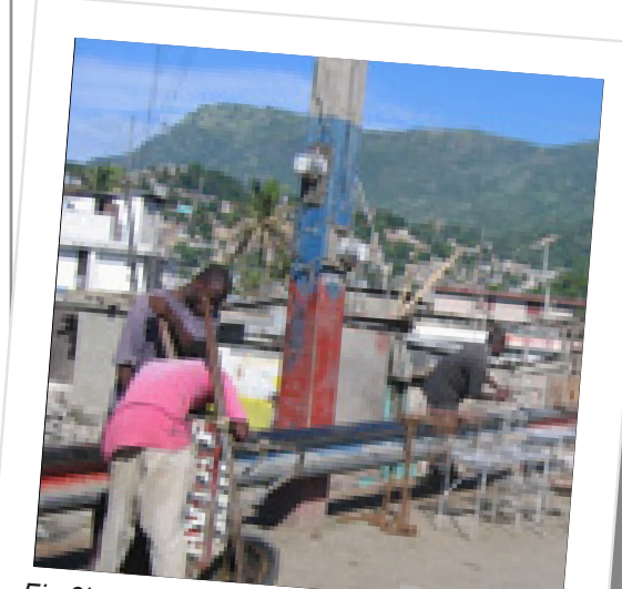
Fig 3b Using electricity from utility pole to arc weld on the side of the street

These materials are provided under the Attribution-Non-Commercial 3.0Creative Commons License, http://creativecommons.org/licenses/by-nc/3.0/. If you choose to reuse or repost the materials, you must give proper attribution to MIT, and you must include a copy of the non-commercial Creative Commons license, or a reasonable link to its url with every copy of the MIT materials or the derivative work you create from it.