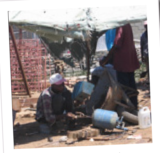
Fig 3a Welding in Haiti: Oxyacetylene welding in a village without electricity

Be sure to use protective clothing and goggles, as the radiation and extreme light can be dangerous to your skin and eyes