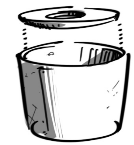
Fig 2a Press fit an endplate configuration

The end plate of the cup will have a 0.8" hole in the center so that the ejector can fit through it. We will use the water jet cutter to make these parts. If you are unfamiliar with the OMAX software and other CAD programs, you may want to run through the tutorial before starting. Use the OMAX Layout program to generate the tool path for the three end plates. You will be shown how to use the water jet cutter in class.