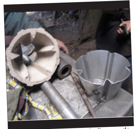
Fig 1 The sheet metal sheller, made at the Fainsa workshop (right) and the original plastic sheller that is was modeled after (left).

You can form the cone by bending it over an anvil or a piece of pipe, by hand or with a hammer or you can bend the whole things by hand. Be careful not to damage the ridges as you form the cone.