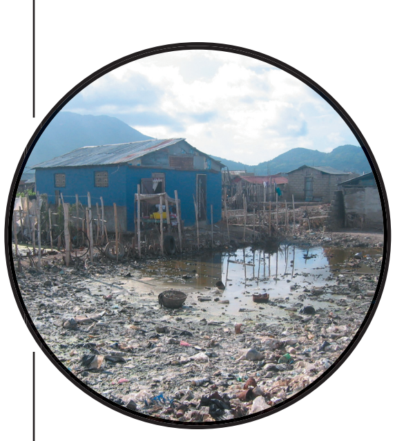
A village in Petite Anse

The next morning, the air of anticipation was palpable as the team opened up the pit to examine the results of the first burn. A crowd had assembled—in addition to members of the cooperative who had helped on the first day, other members of the community had come to watch, including Antonio Etienne, a local businessman who had gone to school in the United States. The results were promising, and the members of the community seemed encouraged by the sight of the charred bagasse and were eager to move on to the next phase—forming the briquettes.